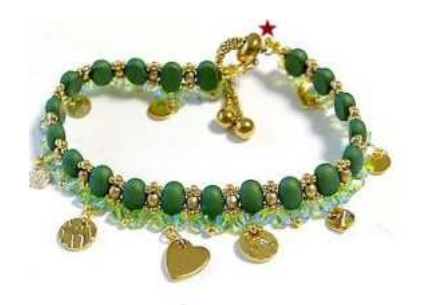
13) Insert the charms through SB11 with 2 jump rings as pictured \odot